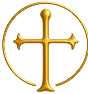
Glyph of the Middle Path Center is where Truth and Peace become One

“Duality is not to be escaped — but integrated.”