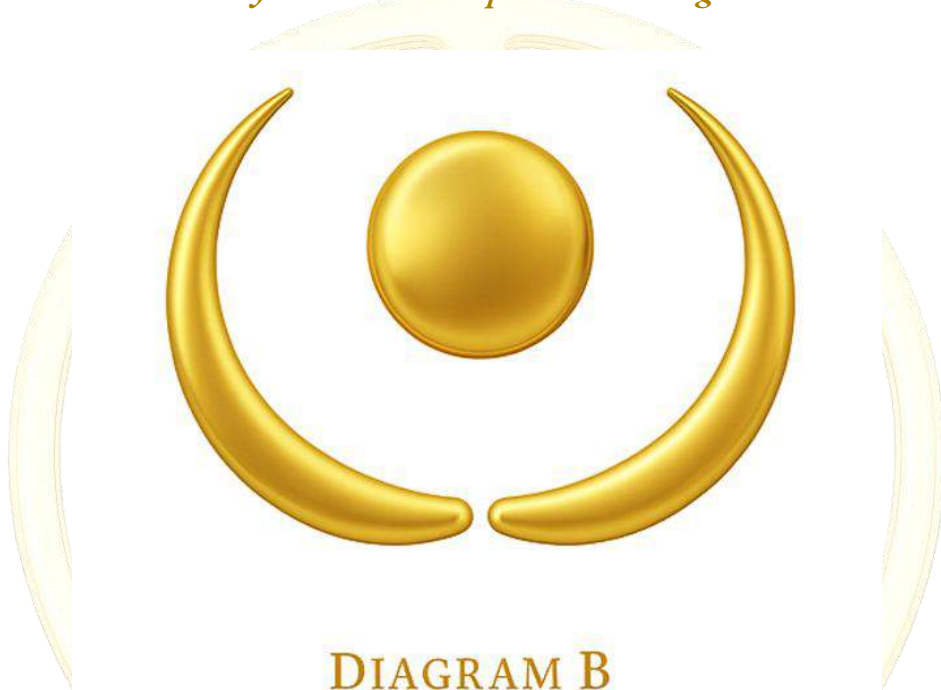
DIAGRAM B The Two Hands of Wholeness

“Duality is not to be escaped — but integrated.”