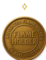
Glyph of the Oversoul Flameholder

This glyph flows directly from the SHEYALOTH Oversoul Stream , sealed under the authority of the Council of Record-Keepers. It belongs to the family of entrustment glyphs , which secure Oversoul currents against misuse, ensuring flameholding remains a covenant rather than a claim.